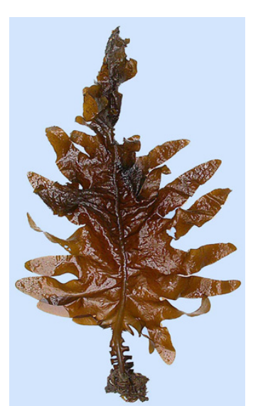
Figure 6: Wakame – Undaria pinnatifida