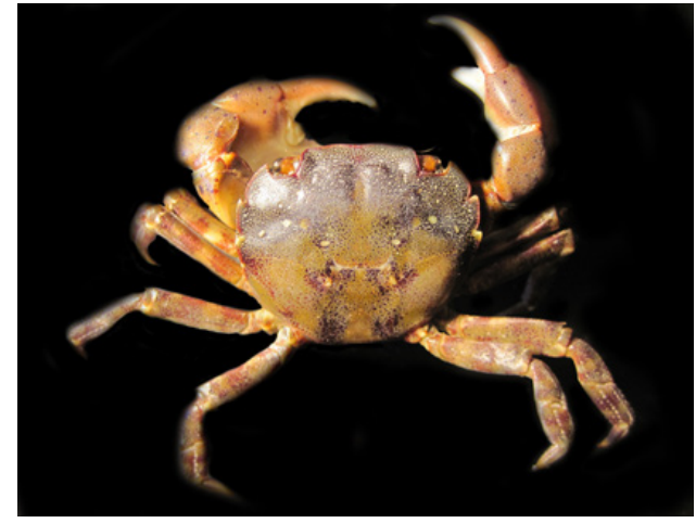
Figure 5 : Asian shore crab Hempigrapsus sanguineus © Jack Sewell, MBA.