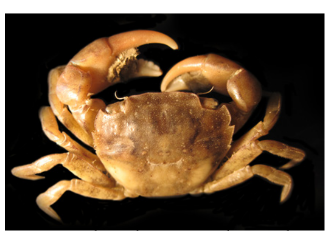
Figure 4: Asian shore crab Hemigrapsus takanoi

These two species of shore crab (Figures 4 and 5) were recorded in the UK for the first time in 2014. Hemigrapsus takanoi from the River Medway, Kent (and retrospectively in preserved samples from a Crassostrea gigas reef in the Colne, Essex in 2013) (Wood et al., 2015a) and H. sanguineus from the shores of Glamorgan and Kent (Seeley et al., 2015). Sea temperatures are currently well within the required parameters for H. sanguineus to become established, with mean summer sea temperatures >13 °C. This temperature was suggested by Stephenson et al. (2009) as the threshold below which the species was not found in Maine, USA. They also reported that mean population densities and reproductive activity increased as mean temperatures exceeded 15 °C and 12 °C, respectively. With current North Sea average summer SST ranging between 14 °C and 16 °C and a predicted future minimum temperature of 15 °C, it would appear likely that the species will benefit from predicted warming and become more abundant in this region. In addition, as storm damage and flooding (phenomena linked to climate change) increases in coastal areas, it is more and more likely that coastal defence structures will be used, with the potential to create additional refugia and suitable habitats for the Asian shore crabs.