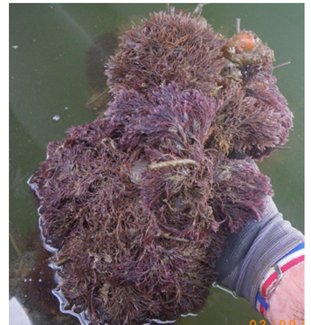
Figure 3 : The ruby bryozoan, Bugula neritina © J.D.D. Bishop, MBA.