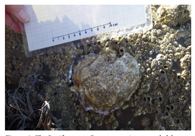
Figure 2: The Pacific oyster Crassostrea gigas recorded from the intertidal zone, south-west Scotland in 2014.

Increasing seawater temperatures are highly likely to have contributed to the recruitment of the commercial Pacific oyster Crassostrea gigas (Syvret et al., 2008; Guy & Roberts, 2010) in natural habitats at a number of more northerly locations in the UK (Kochmann et al., 2012; Cook et al., 2014) and Europe (Wrange et al., 2010), as well as the extensive expansion of this species at existing sites (Herbert et al., 2012). In 2014, a survey was undertaken in Scotland to determine the extent of wild Crassostrea gigas following sightings of this species in the Firth of Forth, SE Scotland (Smith et al., 2014). From the 60 sites surveyed, live wild C. gigas were found in five locations on the north shore of the Solway Firth (SW Scotland) (Cook et al. , 2014) (Figure 2). The majority of C. gigas found in the survey were between 50 – 100 mm in length, comparable in size to those found in the Firth of Forth (Smith et al., 2014). This survey determined the current northern most limit for this species on the west coast of the UK (54.8° N). As more northerly populations are recorded, however, in Ireland (55.1° N) (Kochmann et al., 2013) and Scandinavia (60.0° N) (Wrange et al., 2010), it is highly likely that C. gigas will continue to spread further northwards (Cook et al. , 2014).