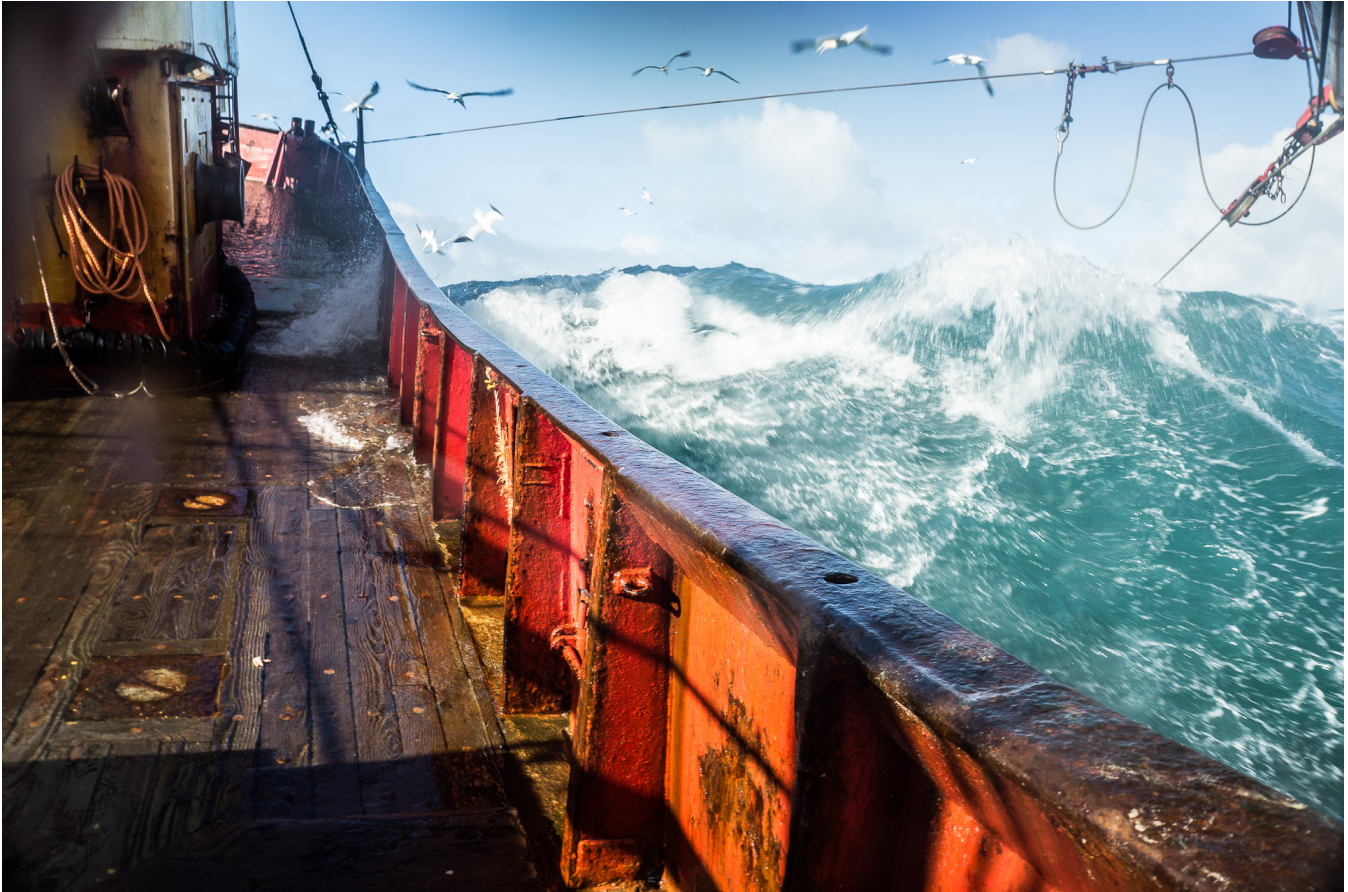
Beam trawler in rough weather

score 12 risk items. Those items listed as causing greatest concern to fishermen's livelihoods included fuel costs, quota restrictions and drowning, whereas more remote issues such as global warming had considerably less resonance. Some of the risk factors that scored highly (e.g. 'drowning' or 'cold/hypothermia') were undoubtedly linked to weather conditions and hence climate, but were not articulated as such.