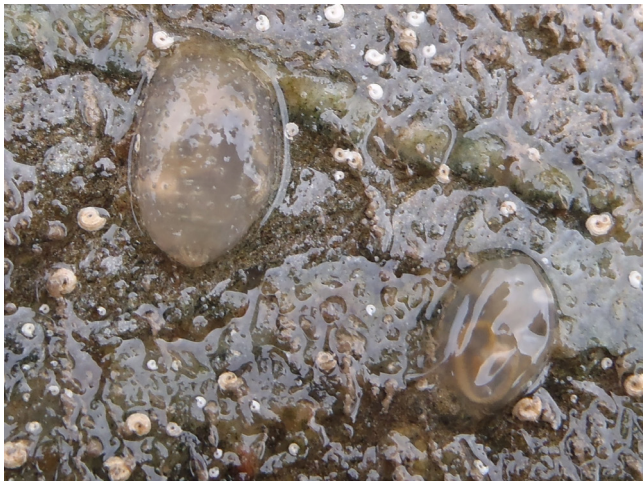
Figure 2: The invasive tunicate Corella eumyota on the rocky intertidal reef at Holyhead, Anglesey. (photo Heather Sugden).

reproductively active and self-sustaining (Campbell, 2012). Natural estuarine and open coast colonisation has increased over the last 2 years in the vicinity of oyster farms in the western English Channel and Scotland. Evidence suggests that the risk to biodiversity from wild settlement of Pacific oysters relates not so much to local changes in species diversity per se but to the extent of habitat transformation (Herbert et al. , 2012).