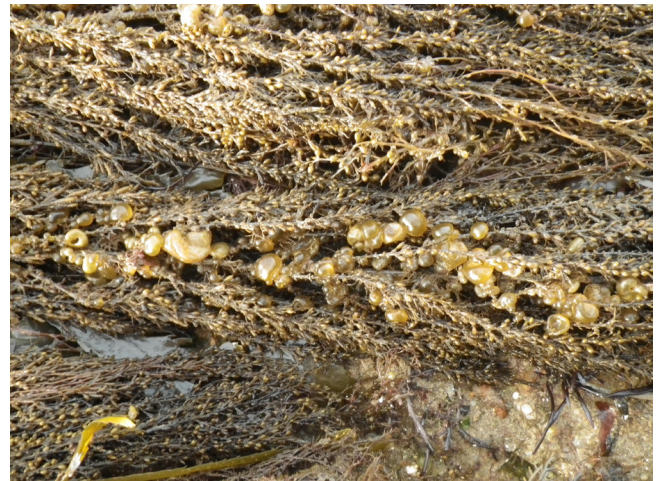
Figure 3: Sargassum muticum acting as a host for Colpomenia peregrina ..

Climate warming is likely to be enhancing colonisation of intertidal chalk by INNS including the invasive brown alga Sargassum muticum , Codium fragile and Colpomenia peregrina on the Isle of Wight and Eastern English Channel, as increases in abundance across the 2000s correlate with increases in sea and air temperature. These species are increasing in abundance and are a threat to native species which are restricted to this limited habitat (Mieszkowska et al. , 2013b). The non-native Pacific oyster Crassostrea gigas