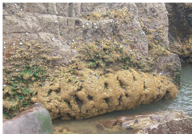
Figure 4: Example of veneer formation of S. alveolata at Bude, north Cornwall.

Blue mussels can form high-density beds which function as a biogenic habitat for a wide range of epifaunal and infaunal species (O'Connor and Crowe, 2007), and are an important food source for seabirds. Blue mussels are boreal ( Mytilus edulis ) and cosmopolitan ( Mytilus galloprovincialis ) in origin. Neither species is exposed to environmental temperature regimes close to their thermal tolerance limits in the UK and Ireland and rising temperatures are not considered to be a major threat to these species over the coming years. Mussels are shell-forming organisms and ocean acidification represents a potential threat to shell-formation and other physiological processes. In a short mesocosm experiment, Beesley et al. (2008) found that CO 2 -acidified water reduced the health of Mytilus edulis through elevated levels of calcium