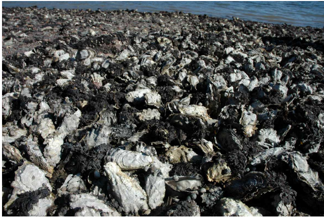
Figure 1: Extensive Crassostrea gigas beds covering soft sediments in the Yealm, Devon..

of the Pacific Oyster Crassostrea gigas . This species was first introduced to the UK in 1890, it was the reintroduction in 1962 under licence from MAFF for aquaculture that resulted in the successful invasion of natural rocky and soft sediment intertidal habitat in the UK by this species (Walne, 1971; Herbert et al. , 2012). Whilst this species attaches to hard substrata on the rocky shore, it is now found in dense beds associated with soft sediment in estuaries, including the River Thames estuary as is the invasive clam Venerupis philippinarum (Worsfold, pers. comm.). Settlement in Crassostrea species is facilitated by a conspecific chemical cue (Pawlik, 1994) and it is likely that the establishment of a few pioneers leads rapidly to further settlement and colonisation. Climate projections are thought likely to result in C. gigas successfully recruiting annually in southwest England, Wales and Northern Ireland by 2040 in response to continually warming marine environmental temperatures (Figure 1; Maggs et al. , 2010).