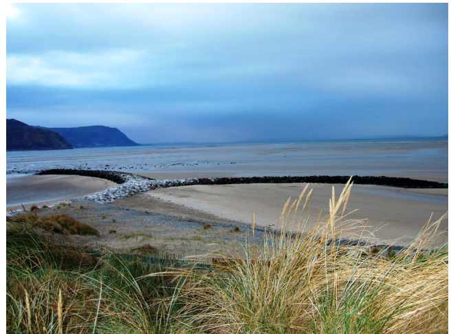
Figure 5: Coastal defence structure at Westshore, near Llandudno, North Wales.

These structures are typically built in locations that are dominated by sedimentary habitats and have the potential to provide habitat for a wide range of hard-bottom marine species. It has been suggested that the structure and functioning of colonising assemblages are analogous to those living on natural rocky shores and that the artificial structures can sometimes function as surrogates or stepping stones between areas of natural rocky habitats (Thompson et al. , 2002; Martin et al. , 2005; Branch et al. , 2008). However, there is mounting evidence that epibiota and fish assemblages associated with artificial structures differ from those on